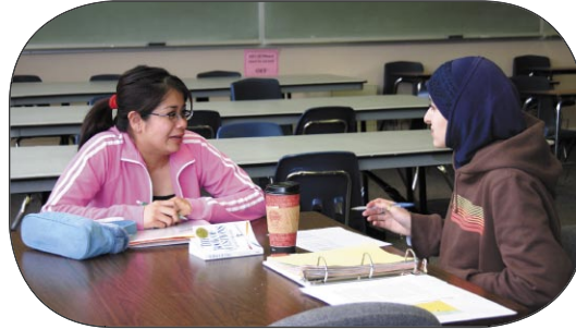
The Writing Center