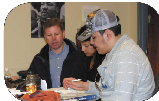
The Math Center