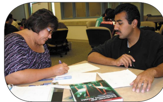
The Tutorial Center