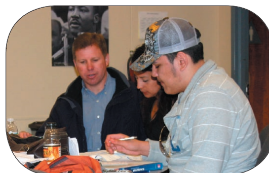
The Math Center