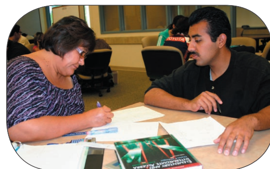
The Tutorial Center