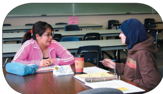
The Writing Center