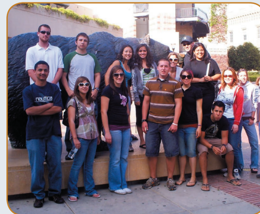
Trip to the U.S. Census Bureau, Hollywood, and UCLA