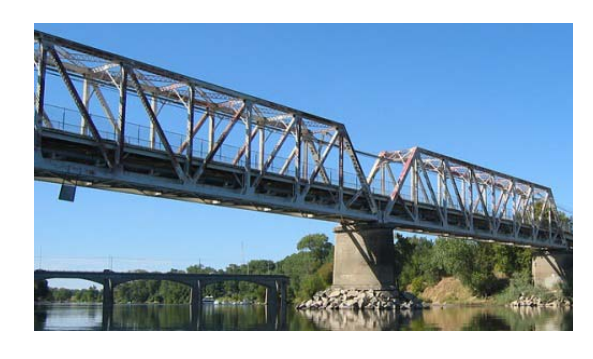
Statics Spring 2015 Engineering 8 Section #55285