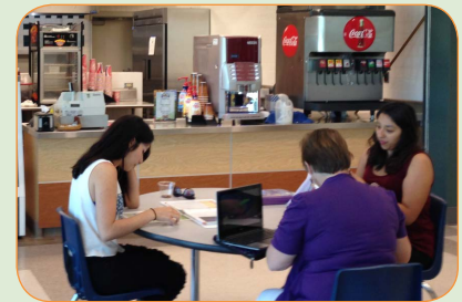
Madera's improved Cafeteria.

The newly remodeled Madera Community College Center Student Center/Cafeteria officially opened in September 2015. The cafeteria has added menu items for student and staff enjoyment.