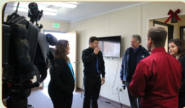
Herdsman Housing residents are interviewed by ABC Channel 30 during the building's ribbon-cutting ceremony in January 2015.

In early 2015, the Herdsman Housing, was complete. It is a home that houses students who work on the campus farm in exchange for residency. The Herdsman Housing is a new four-room residence that is located at the southern end of the campus directly east of the pavilion building.