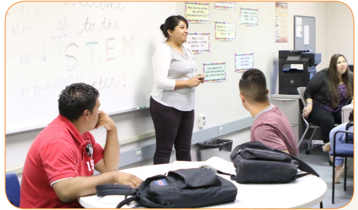
Students are welcomed to the new Madera Community College Center STEM Tutorial Center.

Thank you for assisting us in our dream building, life changing work.