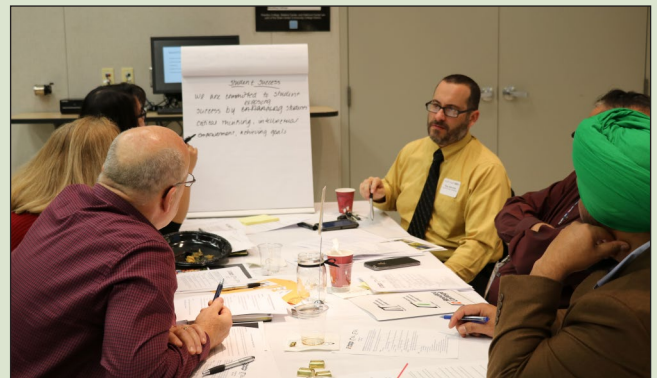
Community members, faculty, staff, and administrators collaborated on the Strategic Plan during one of the Community Feedback Forums held in Madera on January 24.