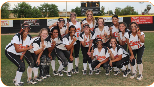
The 2015 Softball Team celebrates after clinching the CVC title in April 2015.