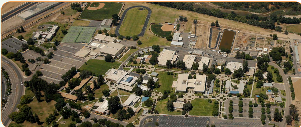
Aerial view of Reedley College in May 2015.