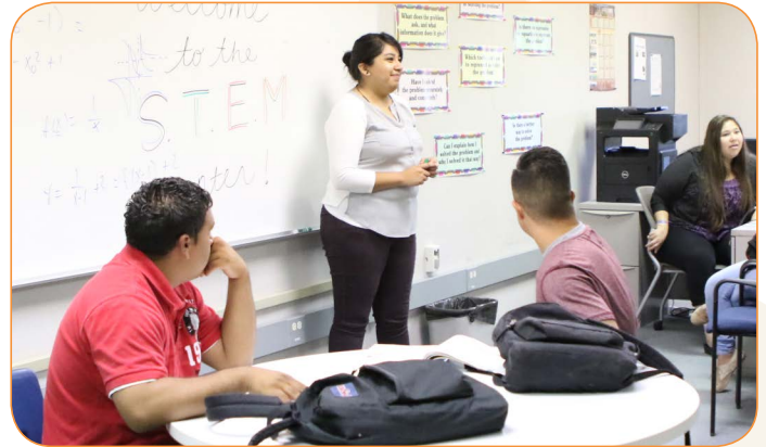
Students are welcomed to the new Madera Community College Center STEM Tutorial Center.

Thank you for assisting us in our dream building, life changing work.