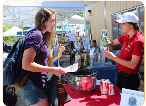
The Oakhurst Community College Center hosted the annual Community Unity event on April 30, 2015.

The Oakhurst Community College Center serves over 500 students each semester from the surrounding foothill communities in the heart of the Central Business District of Oakhurst. The center's facilities include a science lab, two computer labs, and abundant parking on the 2.5 acre site. Students can complete their general education requirements as well as earn a number of associate degrees and certificates. OCCC is working diligently to increase pathways that include developing a hospitality management program and a dual enrollment program with Yosemite High School.