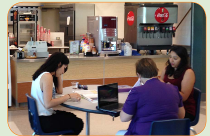
Madera's improved Cafeteria.

The newly remodeled Madera Community College Center Student Center/Cafeteria officially opened in September 2015. The cafeteria has added menu items for student and staff enjoyment.