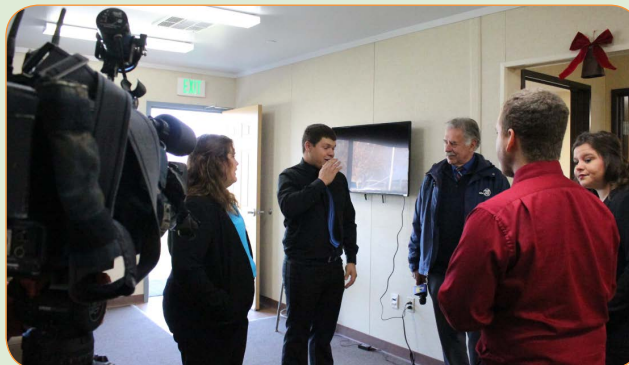
Herdsman Housing residents are interviewed by ABC Channel 30 during the building's ribbon-cutting ceremony in January 2015.

In early 2015, the Herdsman Housing, was complete. It is a home that houses students who work on the campus farm in exchange for residency. The Herdsman Housing is a new four-room residence that is located at the southern end of the campus directly east of the pavilion building.