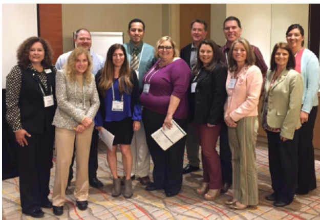
ACCJC Conference attendees

Twelve employees representing faculty, staff, and administration attended the 2017 ACCJC Conference: Partners in Excellence in Irvine April 4 – 7. The conference provided attendees the opportunity to explore multiple ways colleges and the accrediting commission work together to ensure that each student has an outstanding experience in college.