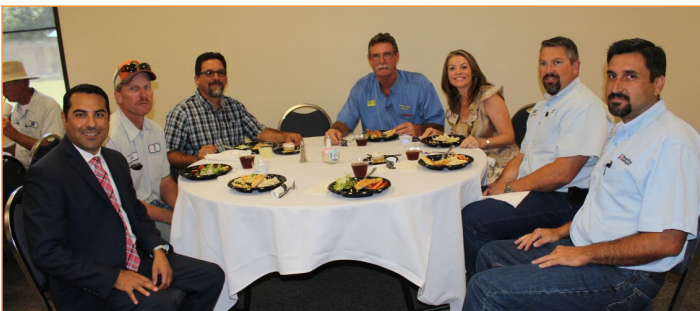
The RC AGNR, Industrial Tech and Business Division enjoyed a free lunch on Sept. 2 for winning the first Center for the Fine and Performing Arts campaign competition.